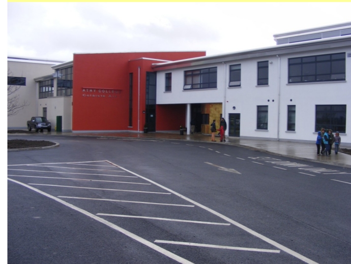
The New Athy College - 'Colaiste Ath I' is now open on the Monasterevin Road