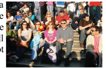
The Spanish Steps

After a gourmet lunch in McDonalds, we visited the Piazza di Spagna, where the Spanish steps are located. We gladly joined the hundreds of other tourists and sat on the steps for a much needed rest! Piazza Navona was our next port call, a beautiful square with many street entertainers, artists and stalls. As we headed back to the hotel we paid a second visit to see the Trevi Fountain in all her glory in daylight. After dinner we headed to Iceland 90 for ice-skating. Not so much dancing on ice, but slipping and sliding!