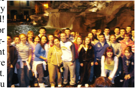
At the Trevi Fountain

On Saturday 3rd March there was a strong sense of excitement in the air as 34 students made their way to the gates of Athy Community College. No, not to class, the day of the school tour had finally arrived! At 8:30am, following emotional farewells to parents, we headed for the airport to catch our flight to Rome. A mere nine hours later, we arrived in our home away from home, the Hotel Noto, a very pleasant hotel in the heart of Rome. After feeding our travel weary troops, we walked to the Trevi fountain, which is lit up magnificently at night. Tradition has it that if you throw a coin over your left shoulder you will return to Rome, needless to say we all gave it a go!