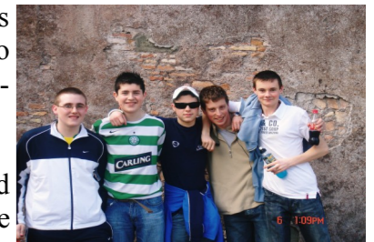
Outside the Catacombs

Following breakfast on Tuesday Morning, we headed to the city centre again, to experience the Time Elevator. This could probably be best described as a history lesson and a rollercoaster ride combined! Our next stop was the catacombs of San Sebastian, It has been estimated that 6 million Christians must have been buried in the catacombs and that if all the galleries were placed end to end, they would stretch for 600 miles, not a good place to get lost! After dinner we headed bowling, just to make sure we got some exercise while we were away!!